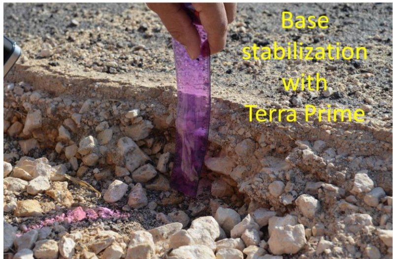
Terra Prime™ in Florence, Texas – More than 4 inches penetration

ORDERING AND RECEIVING TERRA PRIME™. Terra Prime™ is manufactured in Central Texas, USA. For most applications, the product is calculated at a rate ranging from 0.04 to 0.1 gal/sq. yd. Terra Prime™ can be ordered in any quantity and can be shipped worldwide. Please contact Terra Pave International for more information.