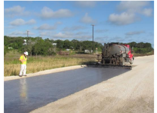
Terra Prime TM application in Florence, Texas

TERRA PRIME TM is an environmentally friendly alternative to asphalt prime coats. Invented at the University of Texas at Austin (UT Austin), Terra Prime TM offers the most cost-effective and risk-free way to improve highways without sacrificing road durability, quality, or stability. Terra Prime TM is an easy-to-use polymer-based emulsion, and it requires no special equipment or handling procedures. In a series of tests, Terra Prime TM outperforms the most widely used alternatives, such as MC-30 and AEP — both of which emit volatile organic compounds (VOCs) and are at least partially prohibited for use in Ozone Nonattainment Areas, like crowded cities and metropolitan areas.