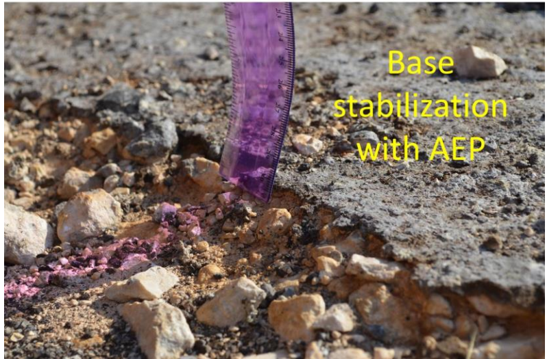
AEP Prime coat in Florence, Texas: Less than 1 inch penetration

TERRA PRIME™ IS THE FUTURE OF BUILDING BETTER ROADS. In today's world, the need to improve transportation infrastructure is felt around the globe. With the current climate of shrinking economies and growing environmental concerns, the pursuit of cost-effective methods for building and improving roads is a high priority for private owners, contractors, municipalities, counties, states, and nations. Terra Prime™ is the right product for the environment with unmatched performance.