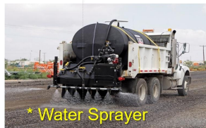
* Water Sprayer