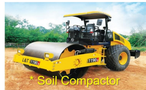
* Soil Compactor

NO SPECIAL EQUIPMENT & NO HANDLING PROCEDURES REQUIRED