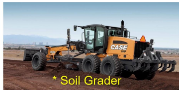
* Soil Grader

COOLER >18 degree F, LESS HEAT ABSORPTION ROAD PAVEMENTS & PARKING LOTS